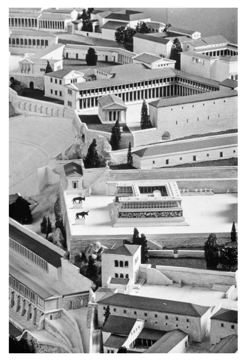
Fig. 8.5 The acropolis of Pergamon: Upper Agora, Great Altar, and the Sanctuary of Athena Nikephorus. Model by Hans Schleiff. Berlin, Staatliche Museen.

in turn were around 170 metres away from the Temple of Athena Polias. The frieze on the south features a type of composition that would have been visible from the Upper Agora, for that composition is characterised by centralised arresting elements and by elements that guide the viewer on (fig. 0.2). In the east section of the south frieze, figures such Phoibe,