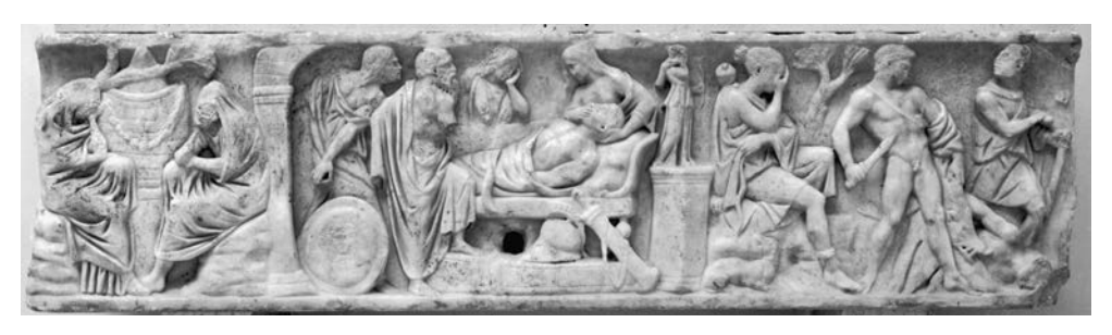
Fig. 8.8 The earliest depiction of Meleager on his deathbed on Roman sarcophagi. Ostia, Museo Archeologico 101; from Ostia. 160 CE.