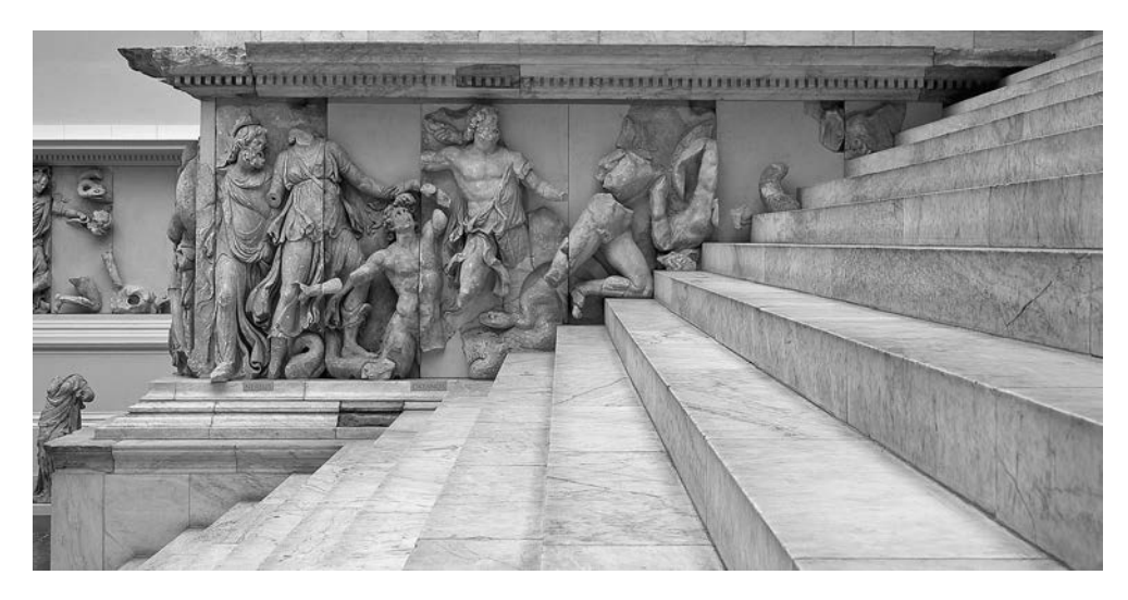
Fig. 8.3 The Great Frieze, north projection: the two giants on the stairs. Berlin, Staatliche Museen.

was painted would have made the figures appear yet closer to the space in front of the picture.<sup>53</sup>