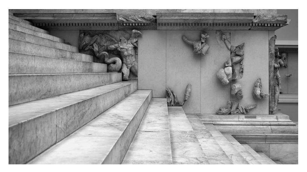
Fig. 8.4 The Great Frieze, south projection: Bronteas on the stairs. Berlin, Staatliche Museen.

the eagle up in the corner of the frieze, just as Bronteas, on the opposite side, fought against the other eagle.