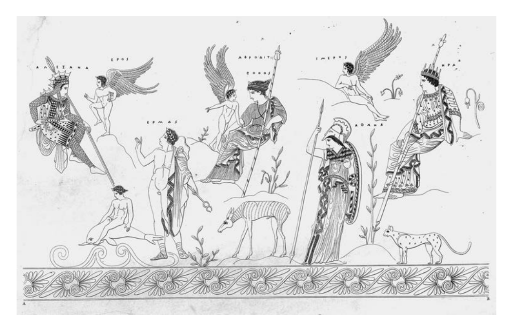
Fig. 8.1 Aphrodite in the centre of the Judgement of Paris. Red-figure hydria by the Cadmus Painter; from Vulci. Berlin, Staatliche Museen F2633 (now lost). 420/410 BCE.

accompanied by Pothus;<sup>40</sup> Paris and Hermes, on the left, and the other two goddesses, on the right, only come into view when the viewer glances side-ways.<sup>41</sup> This breaking down of the scene into individual frames, in terms of both location and content, puts emphasis on the theme of love and desire, but by the same token generates anticipation about the story the scene will