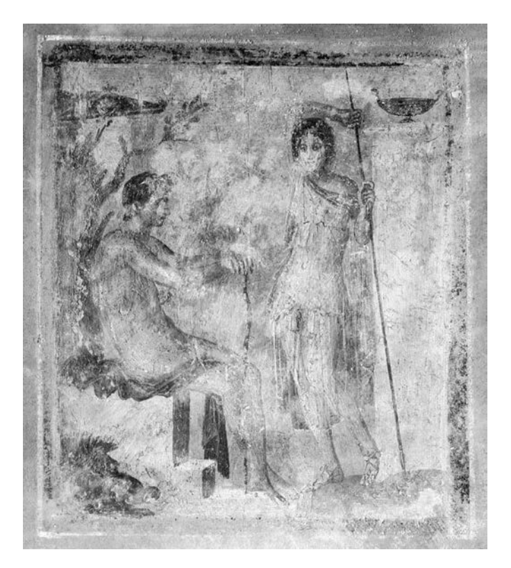
Fig. 8.10 Exploring myth and the everyday: Meleager and Atalanta in the Casa della Venere in Conchiglia in Pompeii (II 3,3). 60/70 CE.

Atalanta not only is a catalyst for such an 'abstract viewing,'<sup>119</sup> but also adds content derived from her mythological persona. The image must therefore be assessed with regard to its character as both a 'real event', a scene of everyday life, and an 'artificial event', a myth.