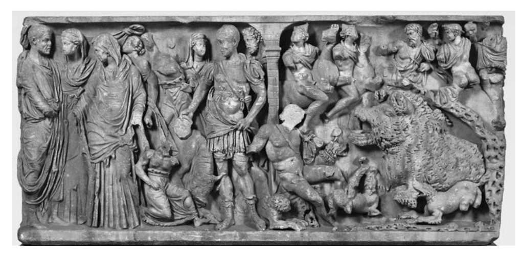
Fig. 8.11 Depicting myth alongside the everyday: the Rinuccini sarcophagus. Berlin, Staatliche Museen 1987,2; from Florence, Villa Rinuccini. 200/210 CE.

sarcophagi such as that with the earliest relief in the deathbed group in Ostia (fig. 8.8),<sup>120</sup> or the unique representation on the near-contemporary Rinuccini sarcophagus, where two scenes from the repertoire of the 'commander' sarcophagi are represented alongside the death of Adonis (fig. 8.11).<sup>121</sup>