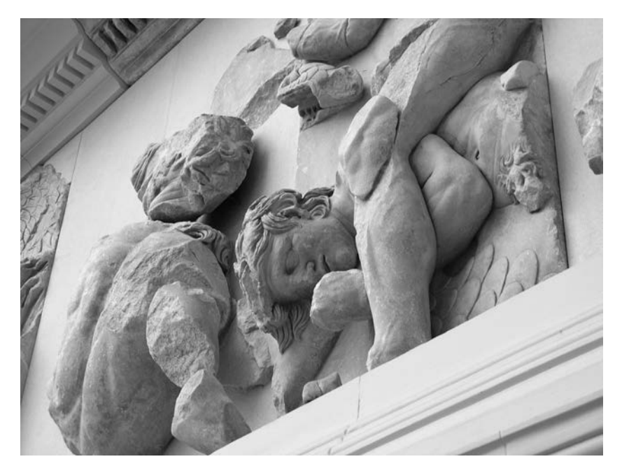
Fig. 8.7 The viewers' perspective: the giant next to Phoibe on the Great Frieze, south. Berlin, Staatliche Museen.

the outside, these satellites connect with viewers, who are thus once more put on a par with the gods.